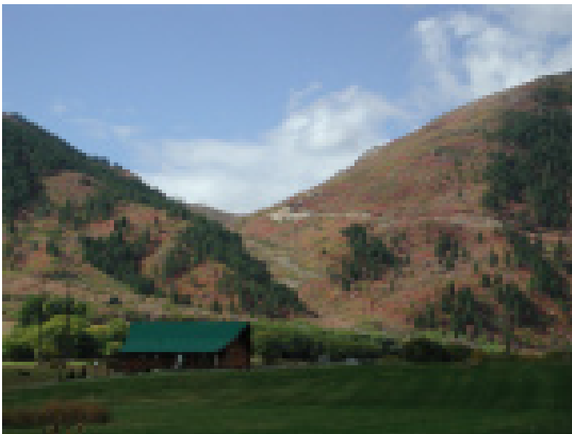
Autumn in Utah's Wasatch Mountains