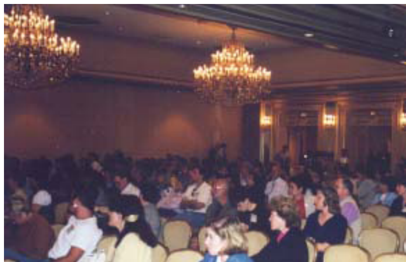
Participants of the 2000 Conference

Medical The Calming Reflex: A New Framework for Understanding Crying An important antecedent to SBS is often a parent's frustration due to an inability to calm their baby's crying. However, dur-