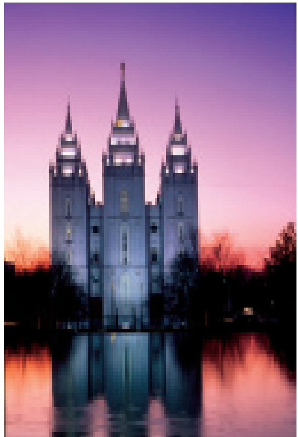
LDS Temple in Salt Lake City