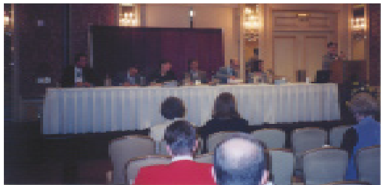
Participants listen to panel presentation